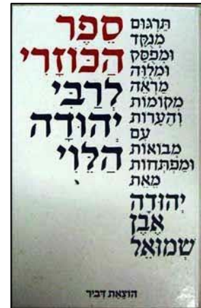
The Kuzari Translation