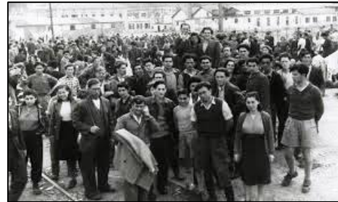
Hunger Strikers at La Spezia Harbor

Passover Fast for the Spezia Survivors. In the year 1946, during the struggle against the British Mandate's blockade of the Israeli coast, when it was sending back Jewish refugee ships to Europe, the Mandatory Government seized several ships carrying over 1200 survivors of the Holocaust from La Spezia harbor, off the coast of Italy. The refugees declared a protest fast to be observed on their boats until they could be admitted to Israel.