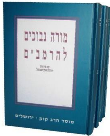
The Guide commentary, 4 volumes