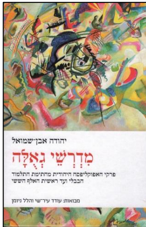
Cover of Midrashim of Redemption