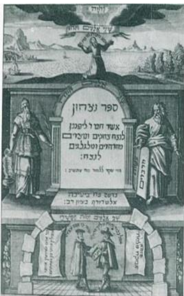
Sefer HaNitzakhon, Altdorf, 1644