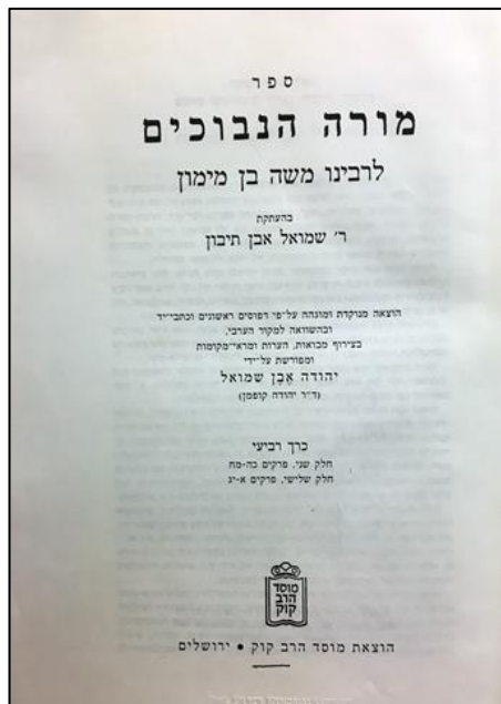
Frontispiece to Fourth Volume of the Guide Commentary

He also continued his great commentary on the Guide of the Perplexed , working on his fourth